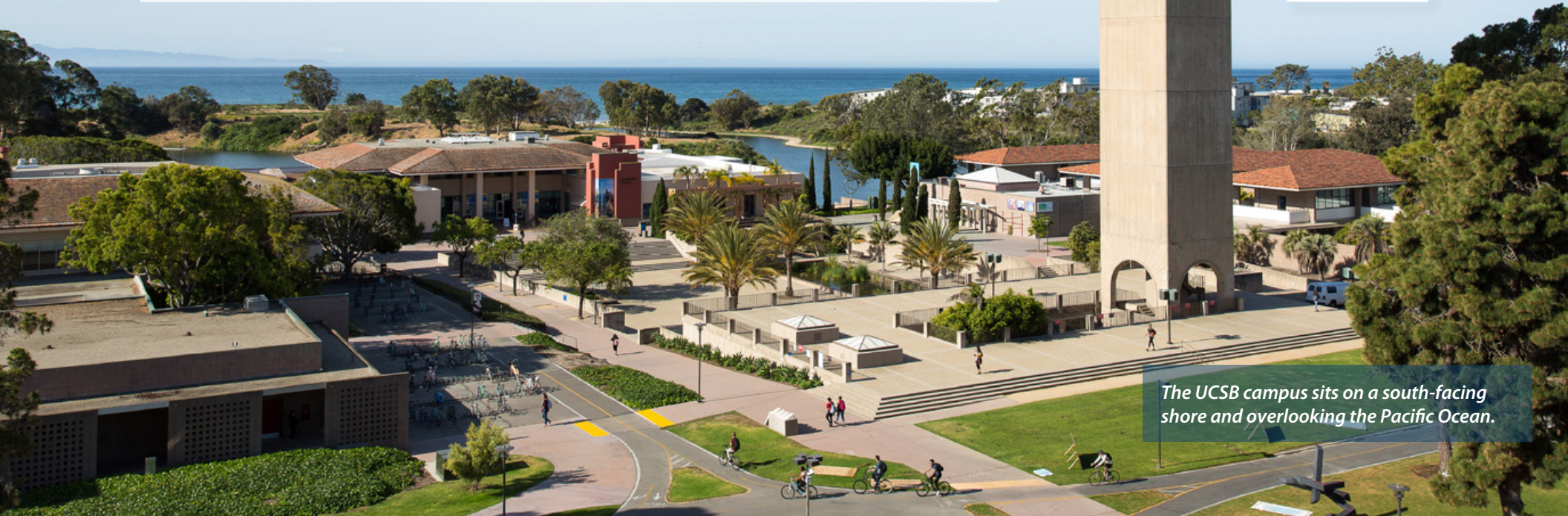
The UCSB campus sits on a south-facing shore and overlooking the Pacific Ocean.

Experience. Integrity. Trust. Since 1993