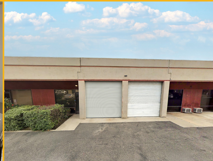
Front Door - Outside