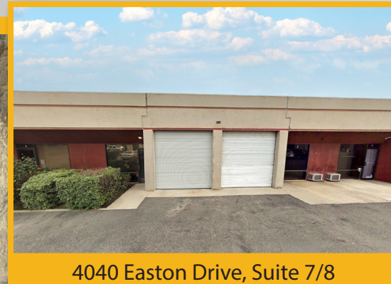
4040 Easton Drive, Suite 7/8