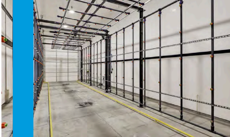
Water Leak Test Bay