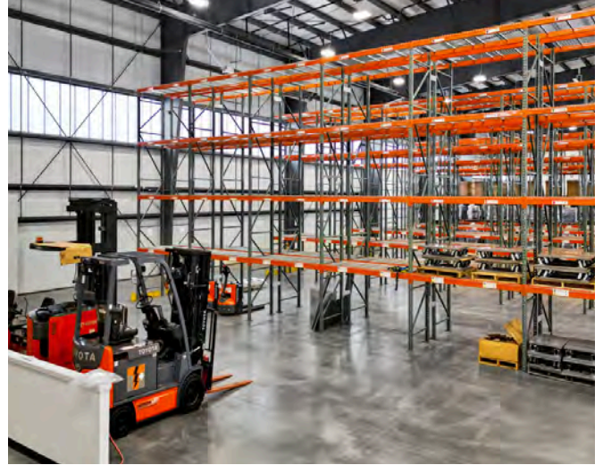
Parts Storage Racking System