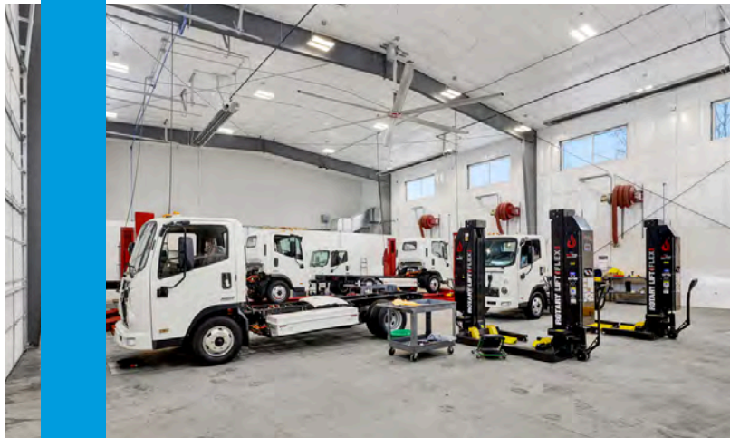
Shop Area W/Vehicle Lifts