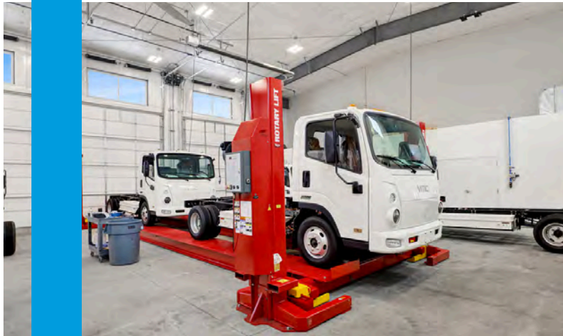
Shop Area W/2 (two) Truck Lifts