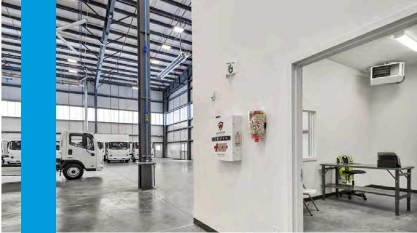
Manufacturing Floor Manager Office