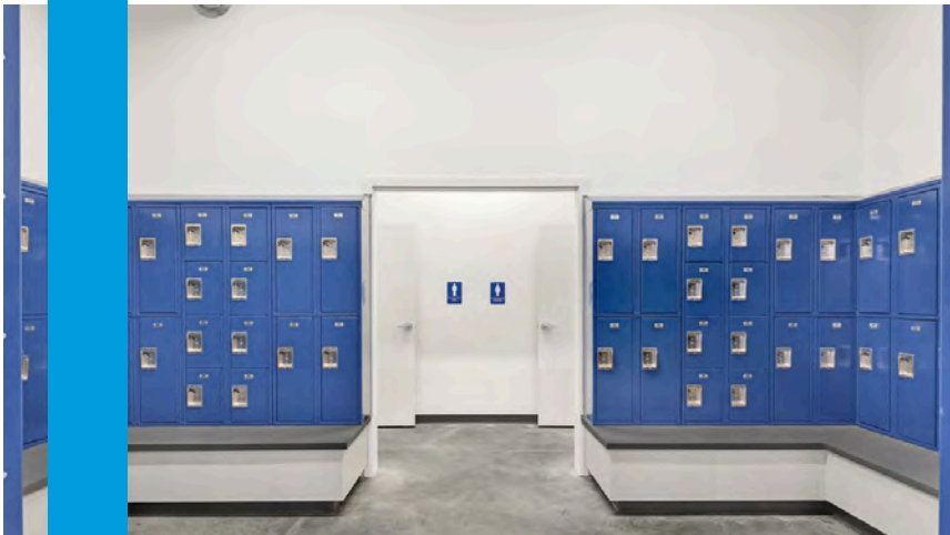
Employee Lockers & Restroom