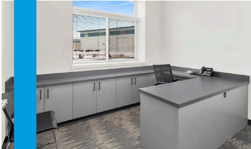
Main Floor Office