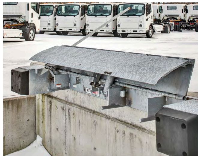
Dock High Vehicle Loading

Strategically located near I-5 and the Canadian border, this cutting-edge manufacturing facility was originally built for EV Bus manufacturing but has never been occupied. the property is currently in receivership as part of company divestiture. This rare opportunity offers unmatched features with no comparable properties currently available.