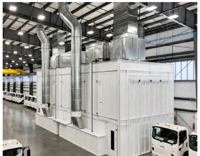
1,200 SF Paint Booth - Exterior