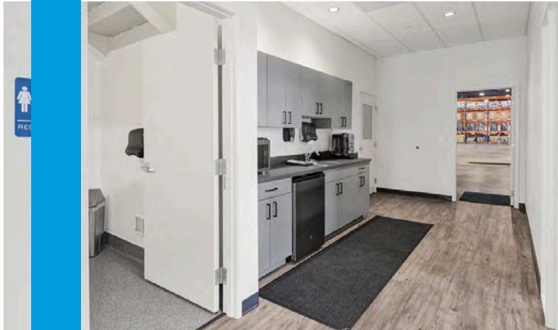
Main Floor Restroom & Coffee Bar