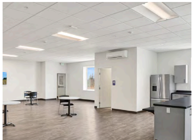
2nd Floor Lunch Room