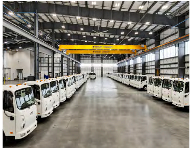
Main Manufacturing Floor w/ 3-Ton Overhead Cranes