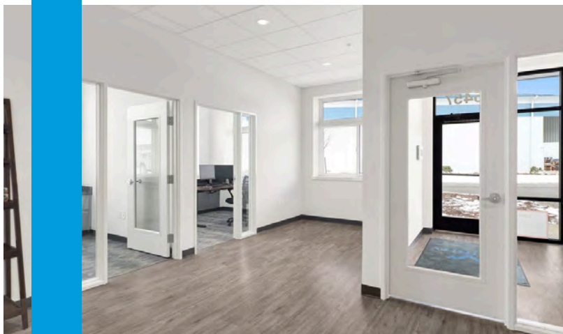
Main Floor Office Space