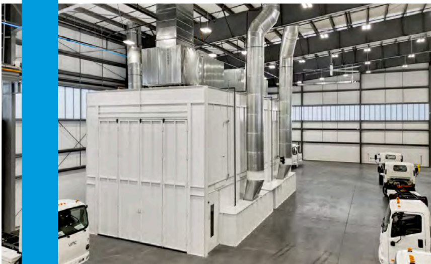
1,200 SF Paint Booth