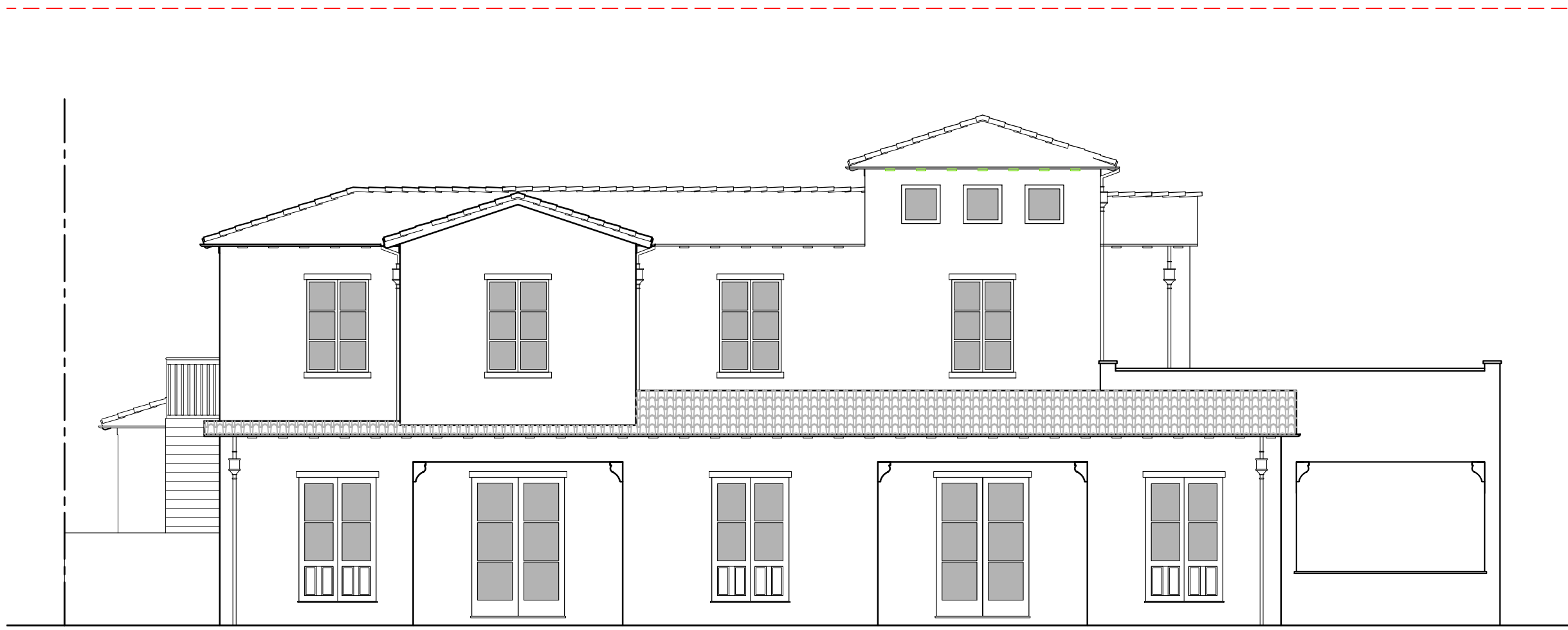
CENTER AVE LEFT SIDE ELEVATION