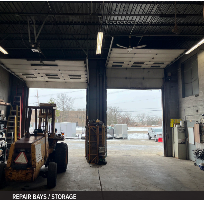
REPAIR BAYS / STORAGE