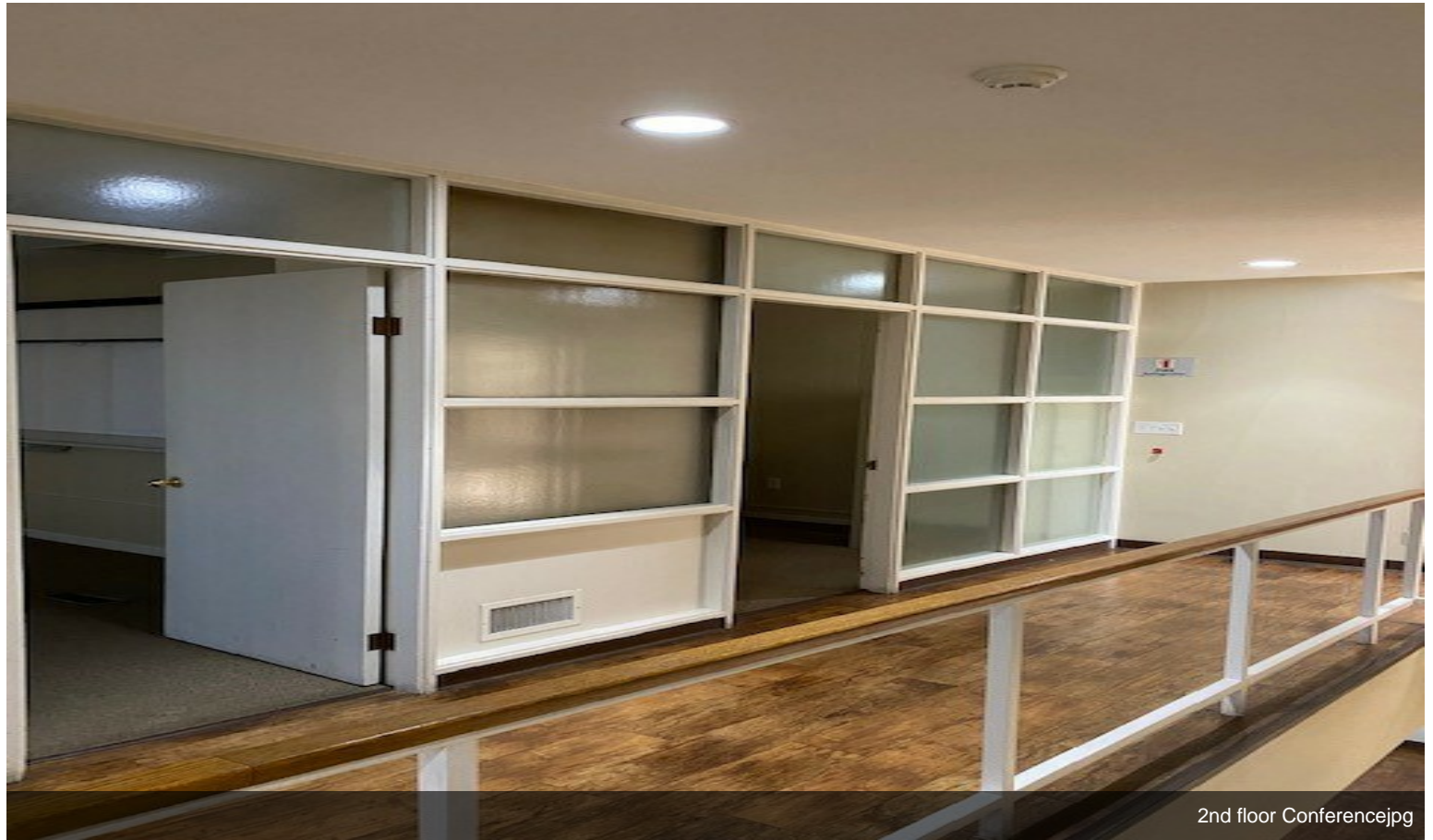
2nd floor Conference.jpg