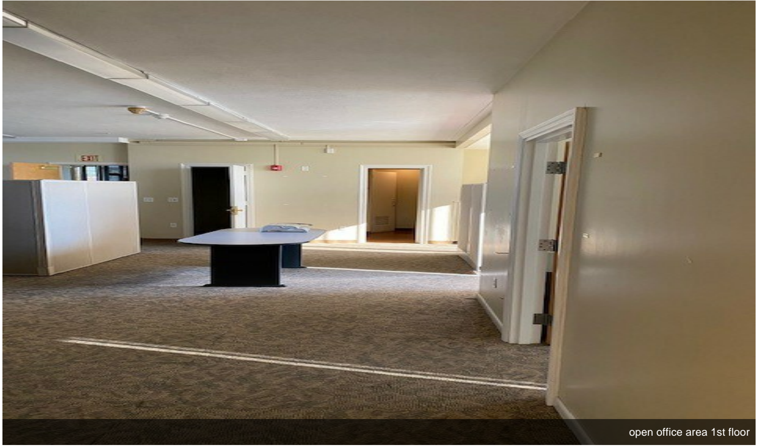
open office area 1st floor