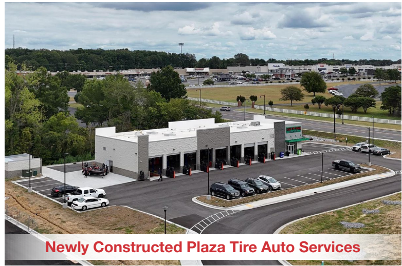
Newly Constructed Plaza Tire Auto Services