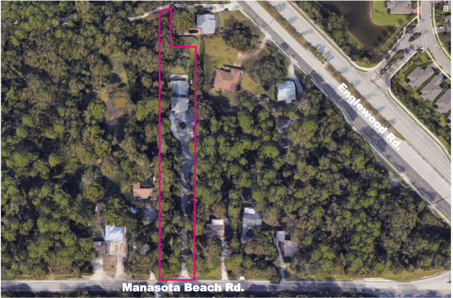
Manasota Beach Rd.