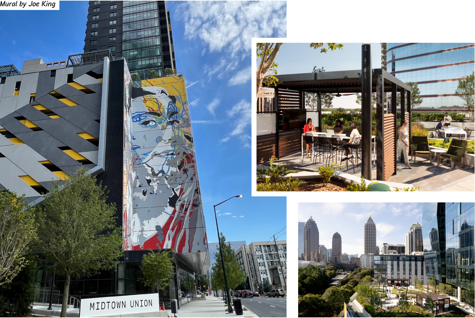
Mural by Joe King