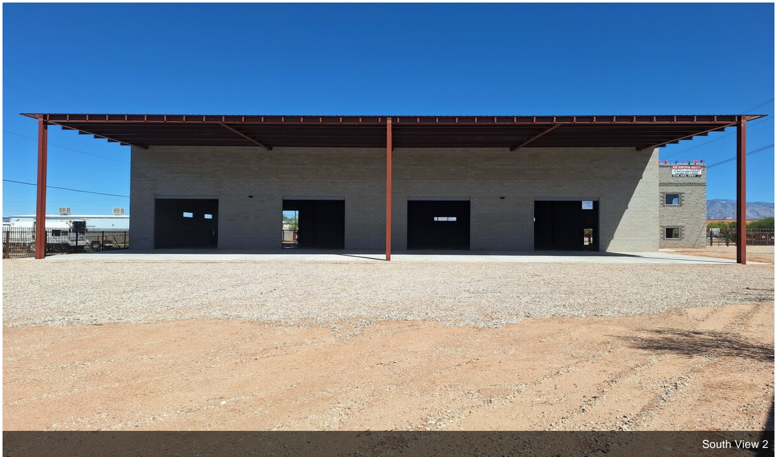
South View 2