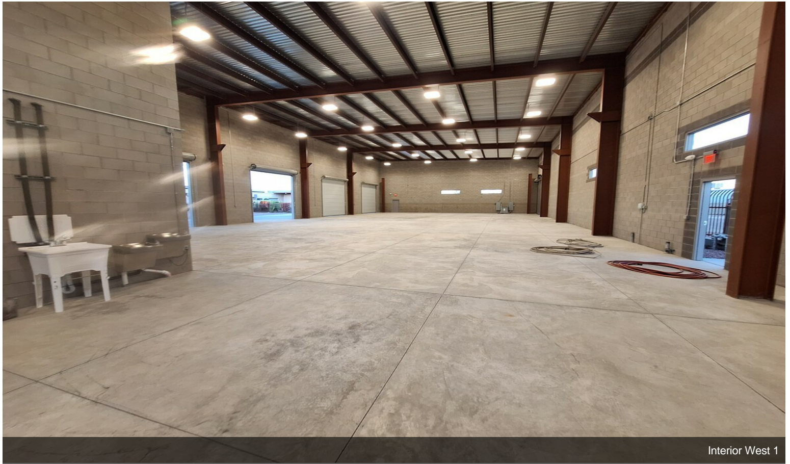
Interior West 1