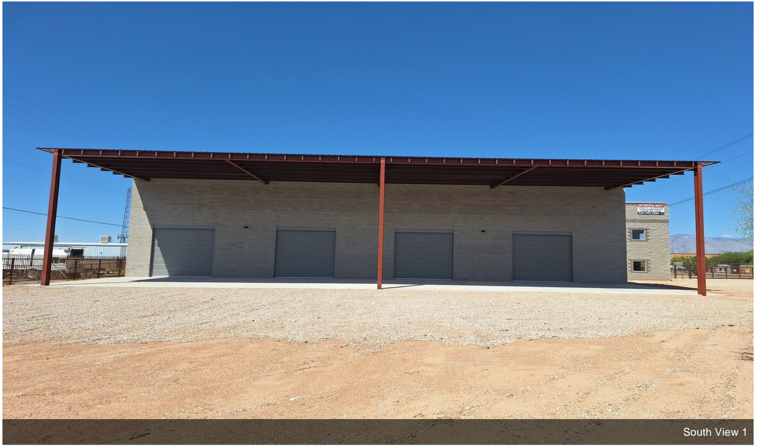
South View 1