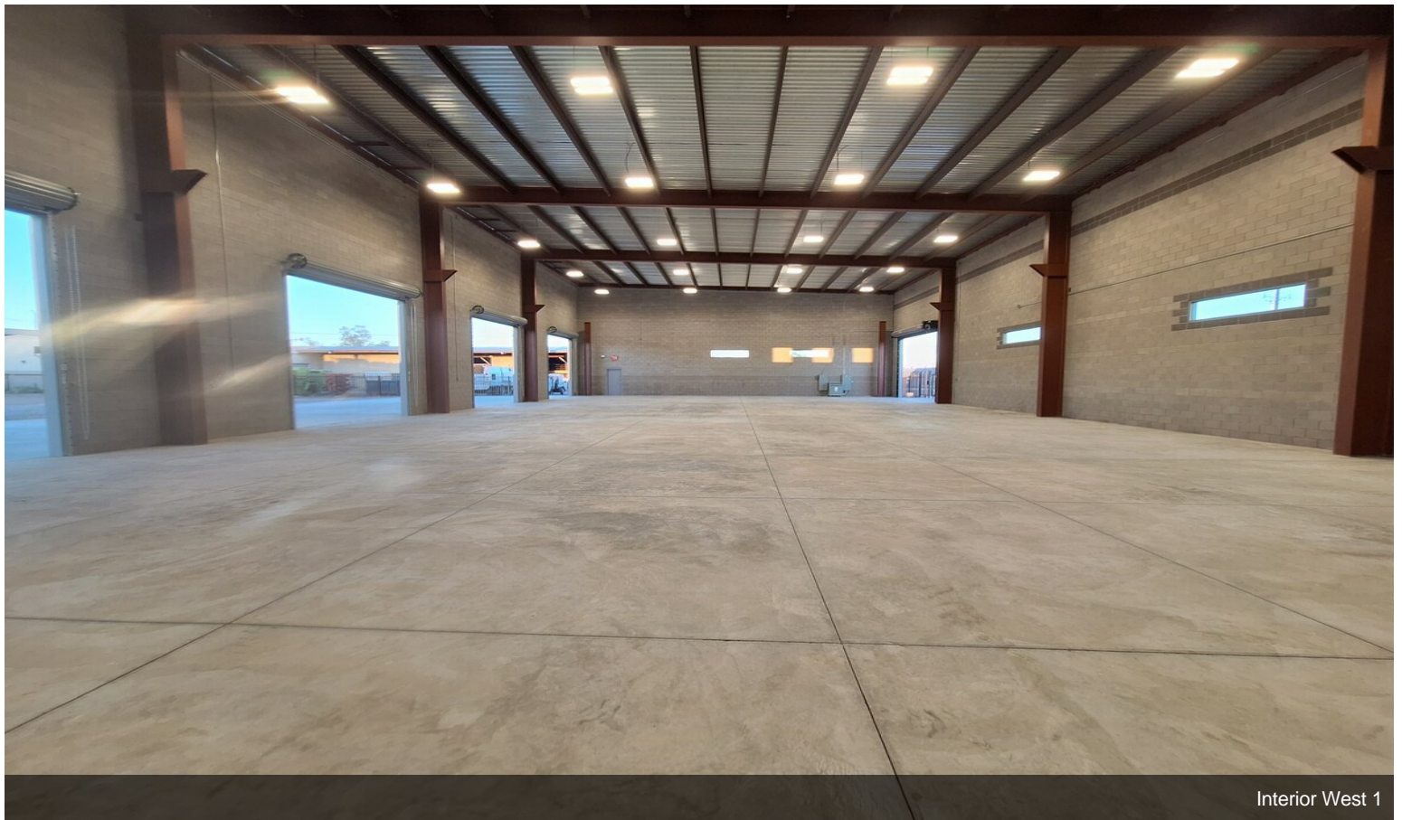
Interior West 1