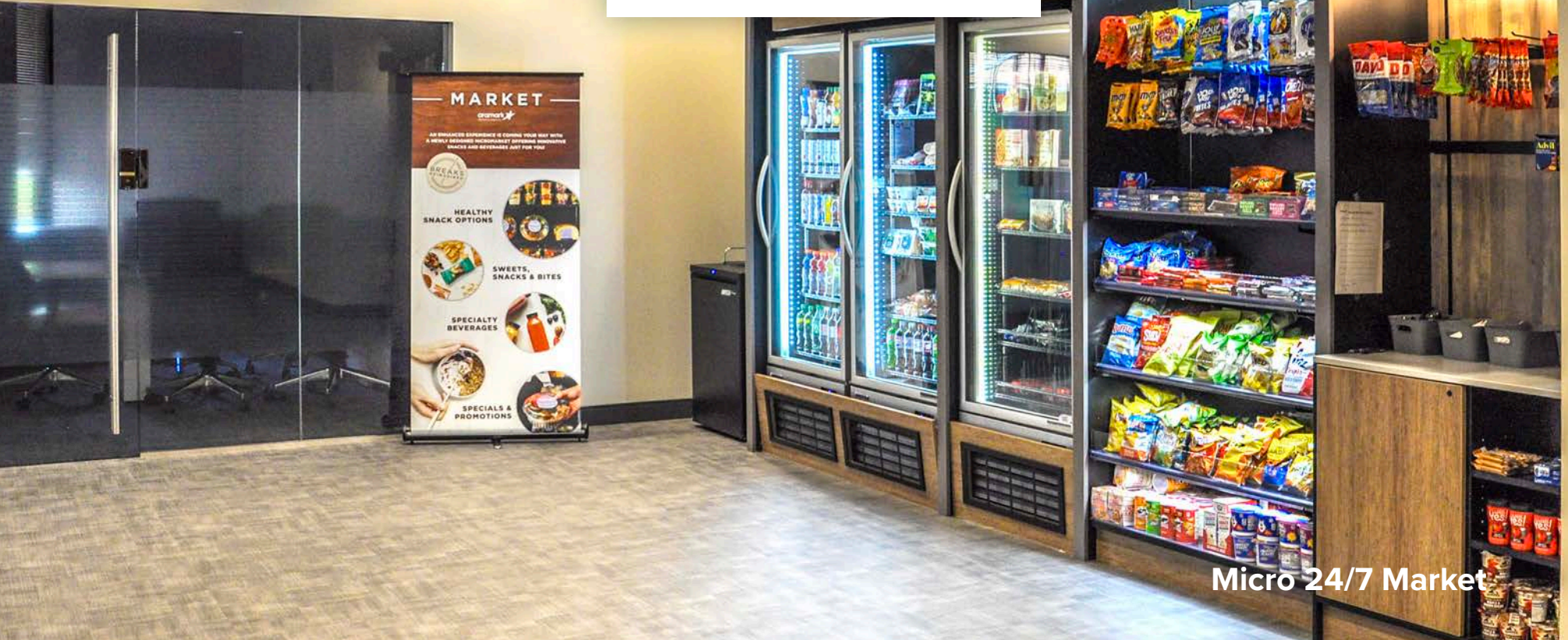
Micro 24/7 Market