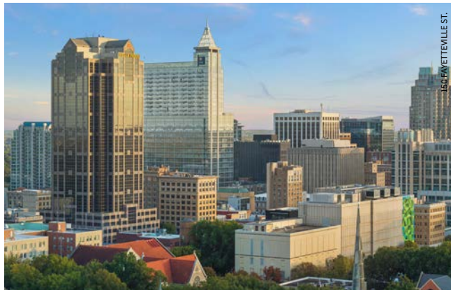
150 SCHUYTTEVILLE ST.