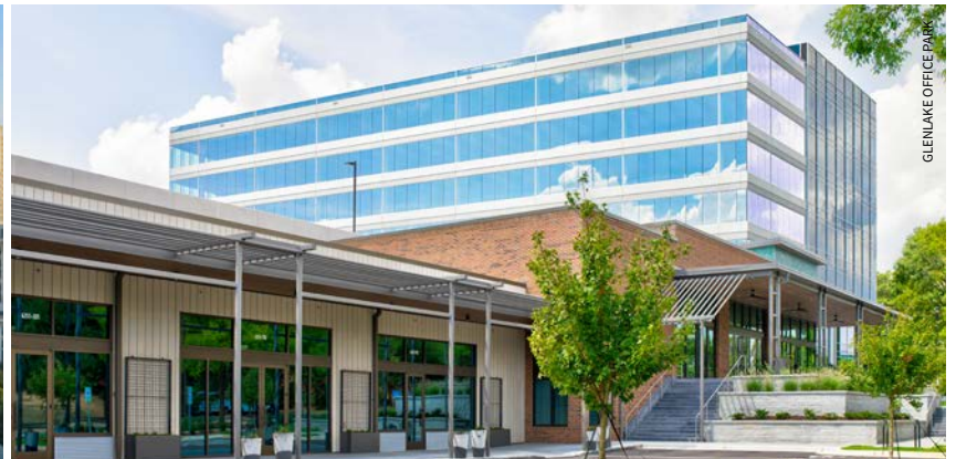
GLENLAKE OFFICE PARK