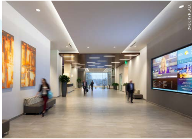
ONE CITY PLAZA