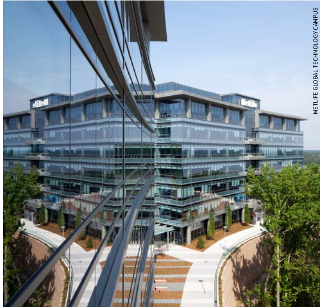
METLIFE GLOBAL TECHNOLOGY CAMPUS