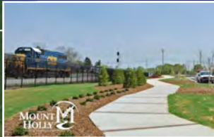
MOUNT HOLLY RIVER HAWK GREENWAY