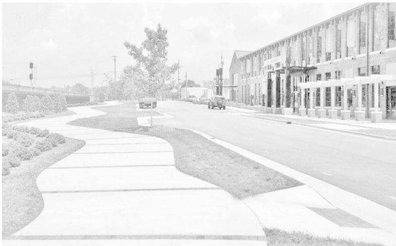
Potential site plan and rendering