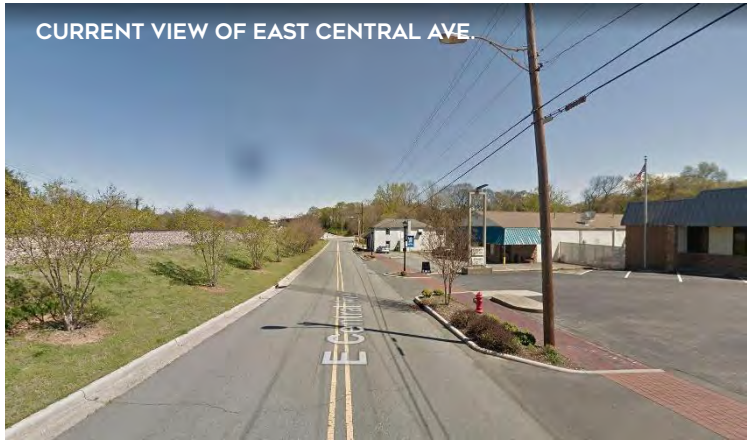
CURRENT VIEW OF EAST CENTRAL AVE