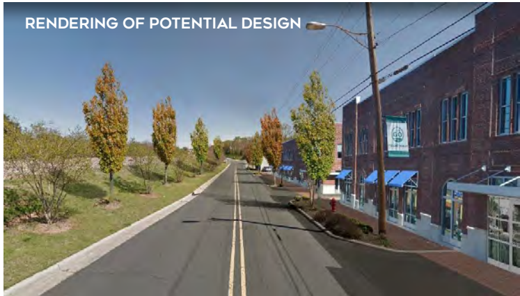
RENDERING OF POTENTIAL DESIGN