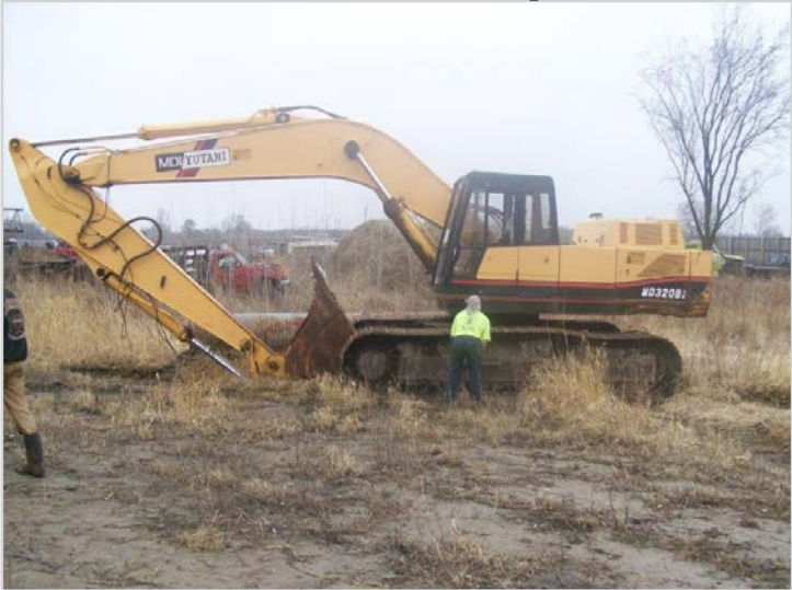
Rice Lake Truck Scale 70' (120,000 Cap)