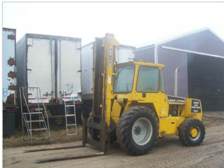
Loadlifter 2400 4-Wheel Drive