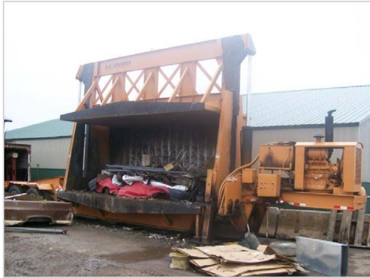
1996 EZ Crusher Model A