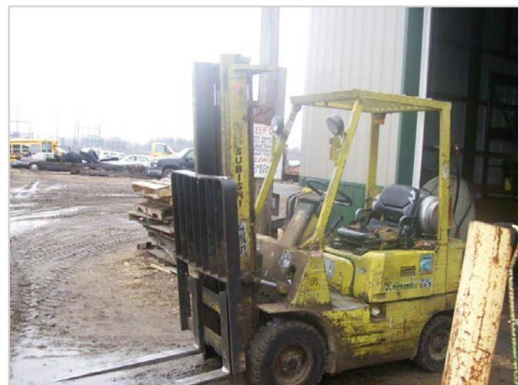
LP Forklift FG Mitsubishi Explosion Proof