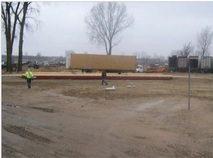
MDI Yutani MP32013