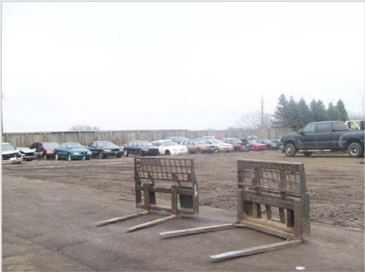
New Holland W80B Forks