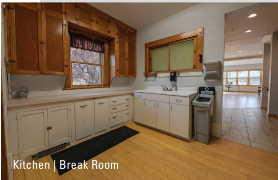
Kitchen | Break Room