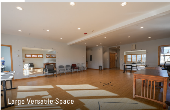
Large Versatile Space