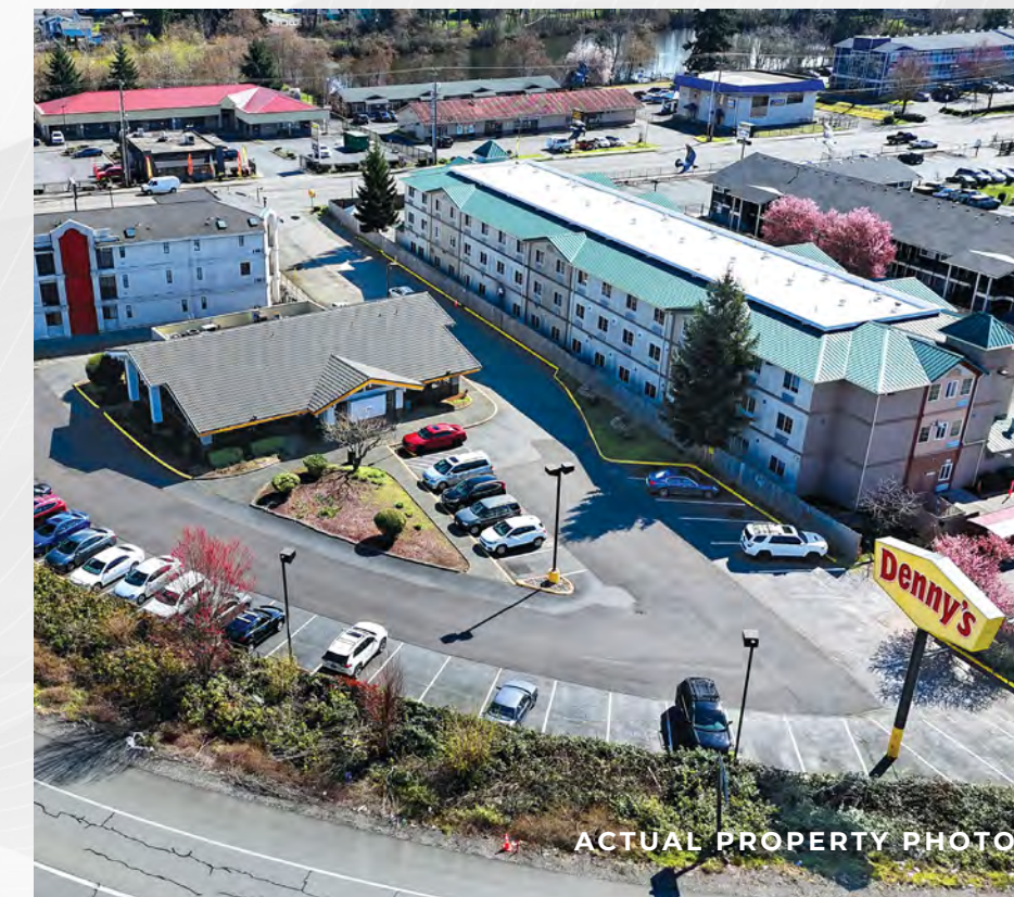
ACTUAL PROPERTY PHOTO