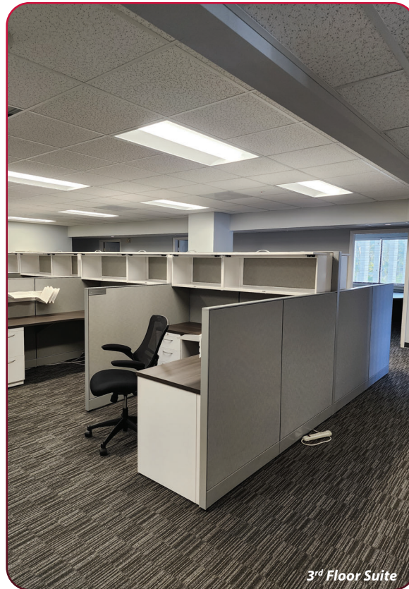
3 rd Floor Suite