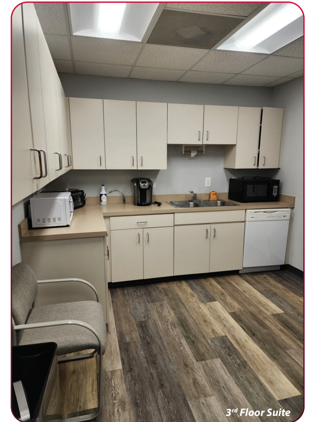
3 rd Floor Suite