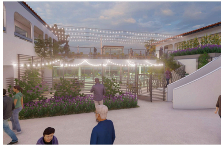
PROJECT DESIGN - BACK PATIO