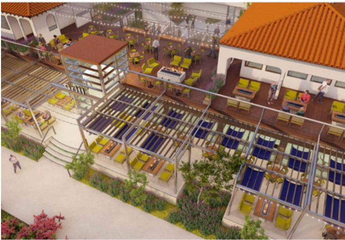
FAÇADE PROJECT DESIGN - AERIAL OF FAÇADE