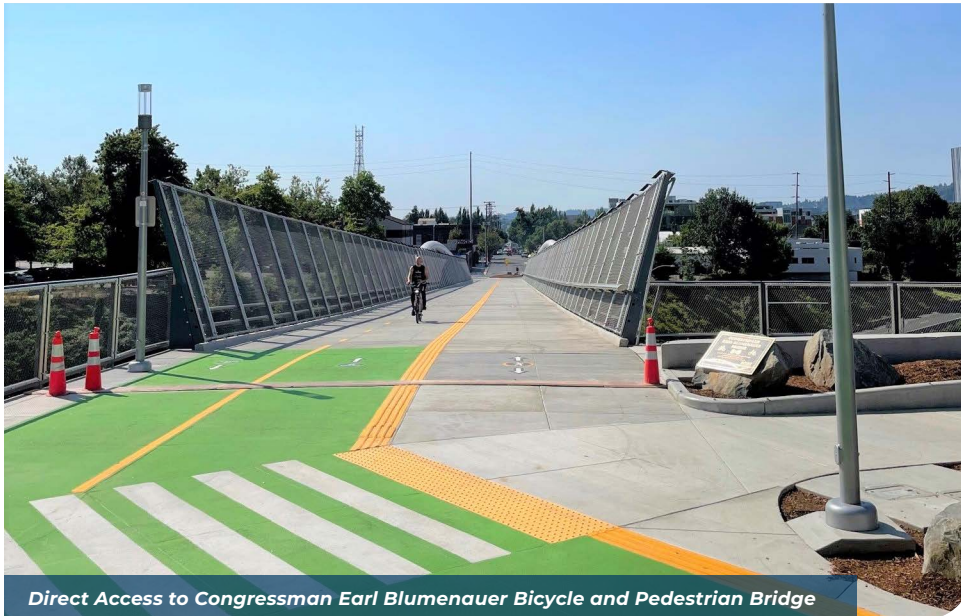
Direct Access to Congressman Earl Blumenauer Bicycle and Pedestrian Bridge