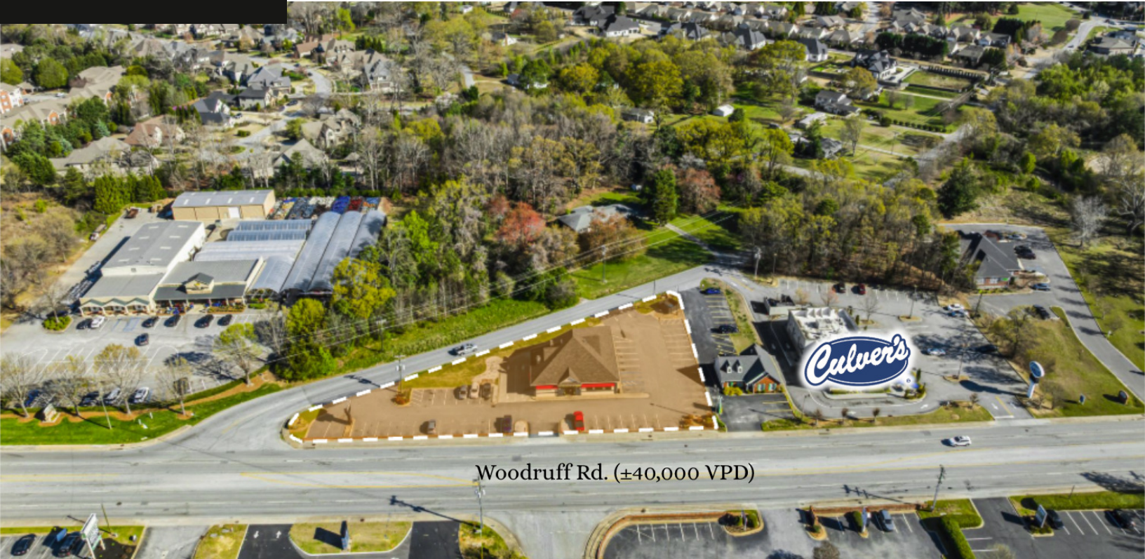
Woodruff Rd. (±40,000 VPD)