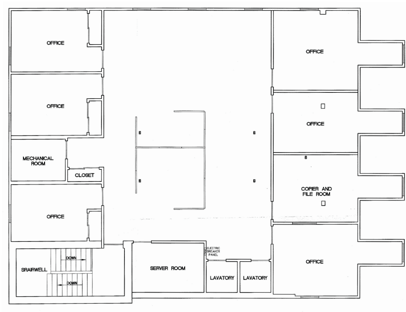
Suite 4 - 2 nd Floor