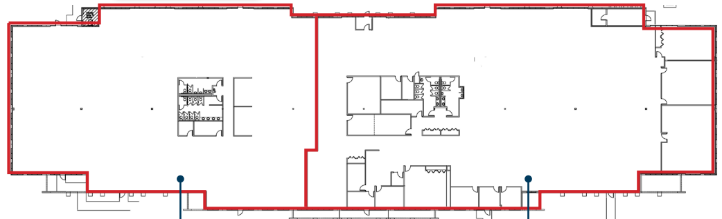
BUILDING C 2355 Briargate Parkway