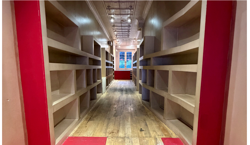
INTERIORS - SPACE B