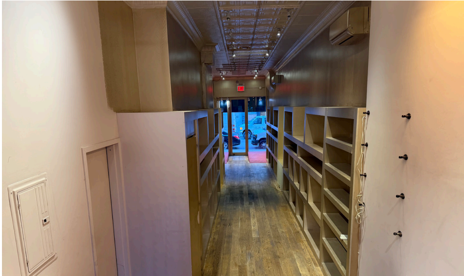
INTERIORS - SPACE A