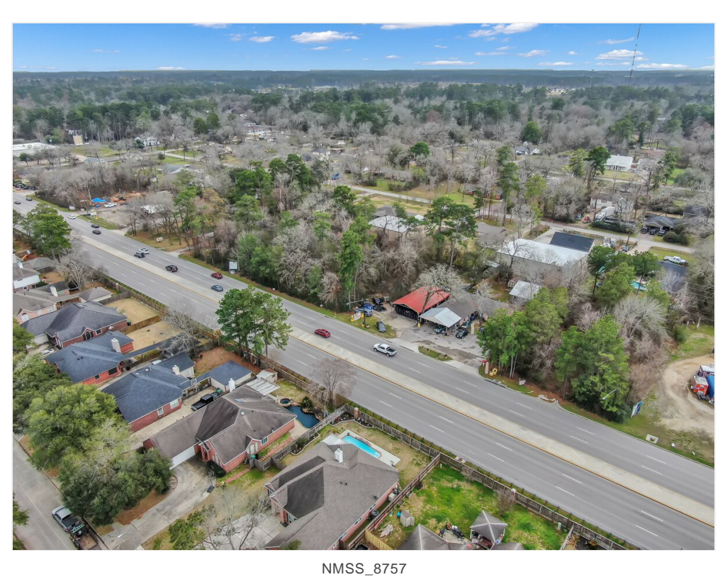
Rayford Road Aerial Photo