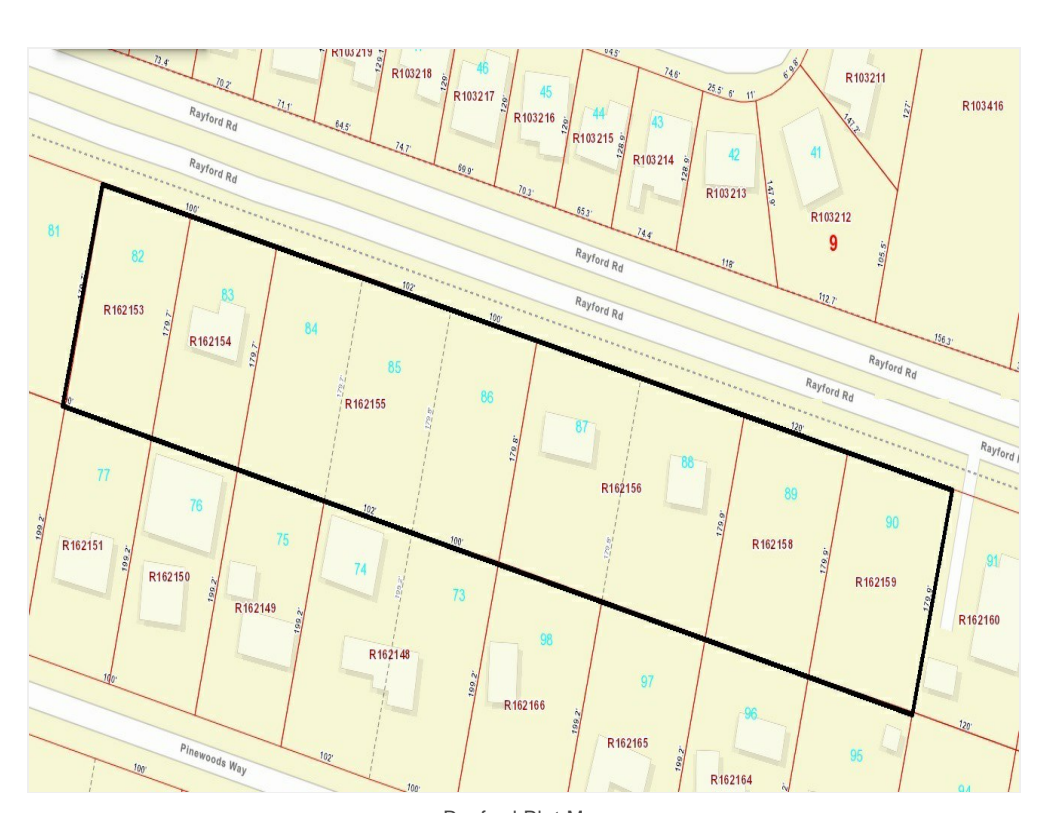
Rayford overhead Rayford Plat Map