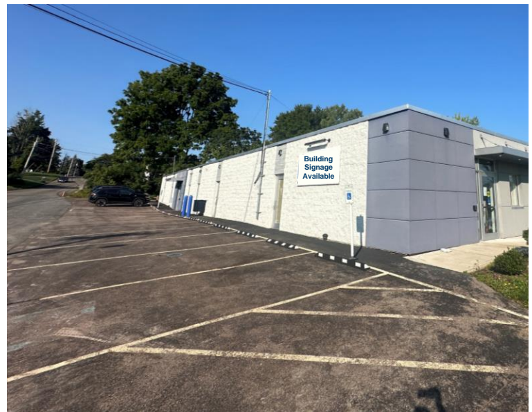
Side parking area