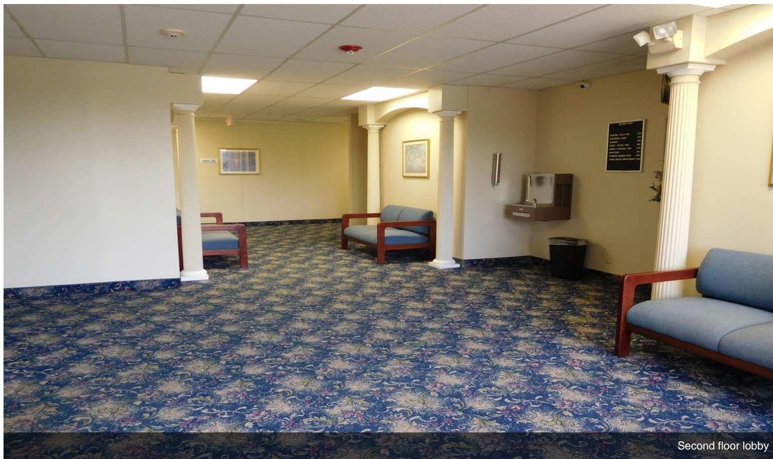
Second floor lobby