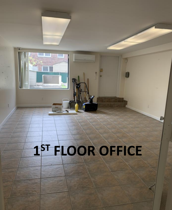
1 ST FLOOR OFFICE