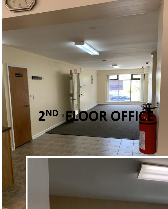
2 ND FLOOR OFFICE