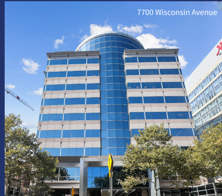
7700 Wisconsin Avenue