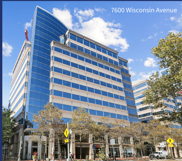
7600 Wisconsin Avenue