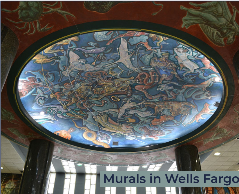
Murals in Wells Fargo