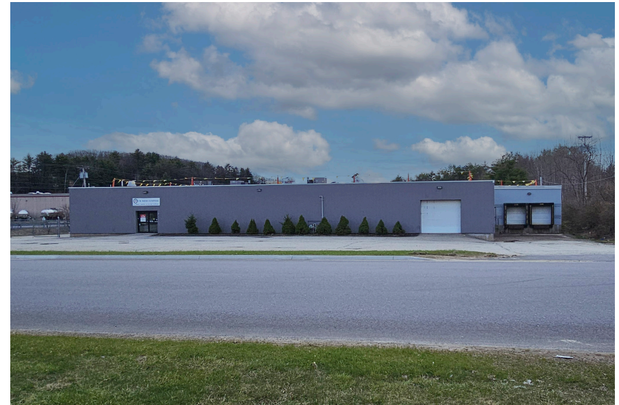
LEWISTON TAX MAP 95, LOT 014