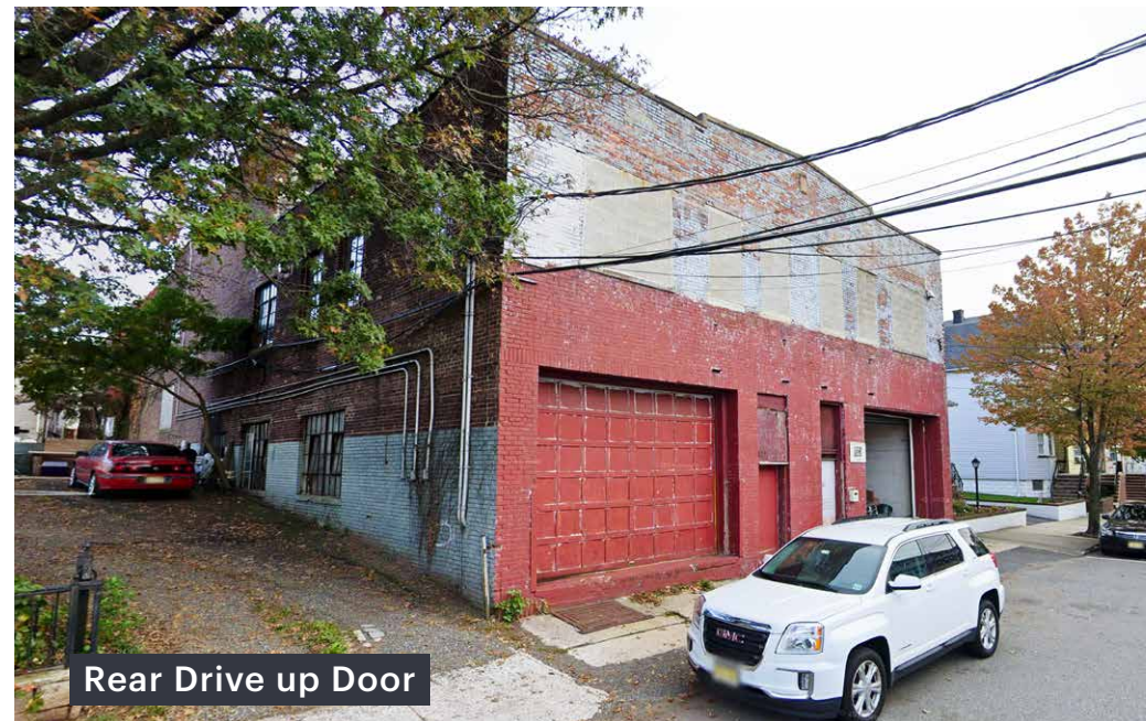
Rear Drive up Door