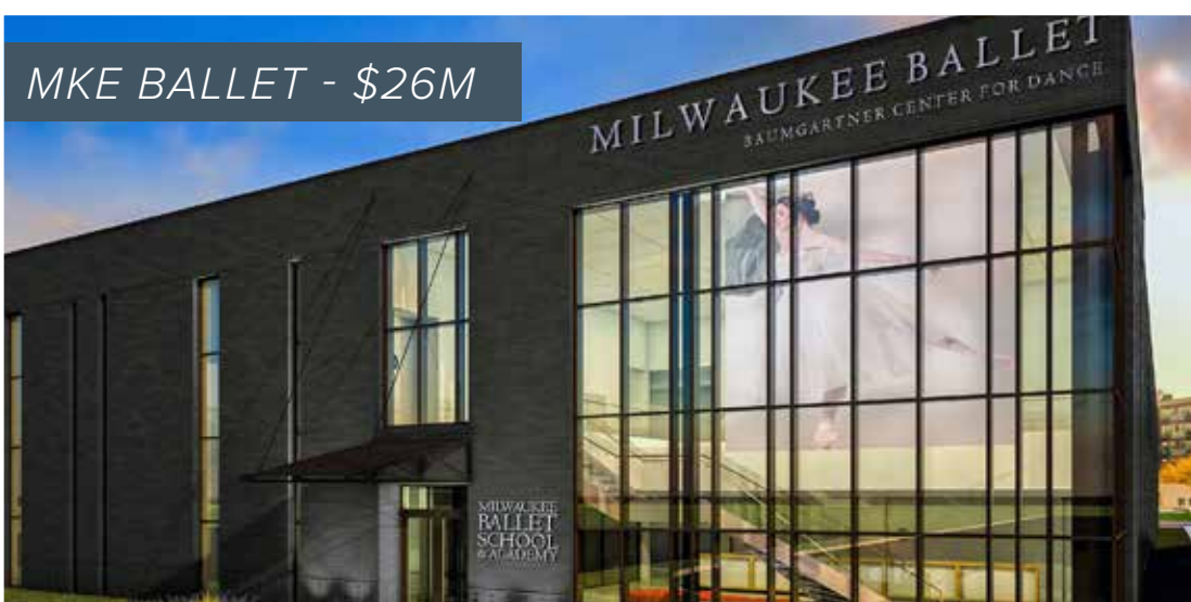
MKE BALLET - $26M