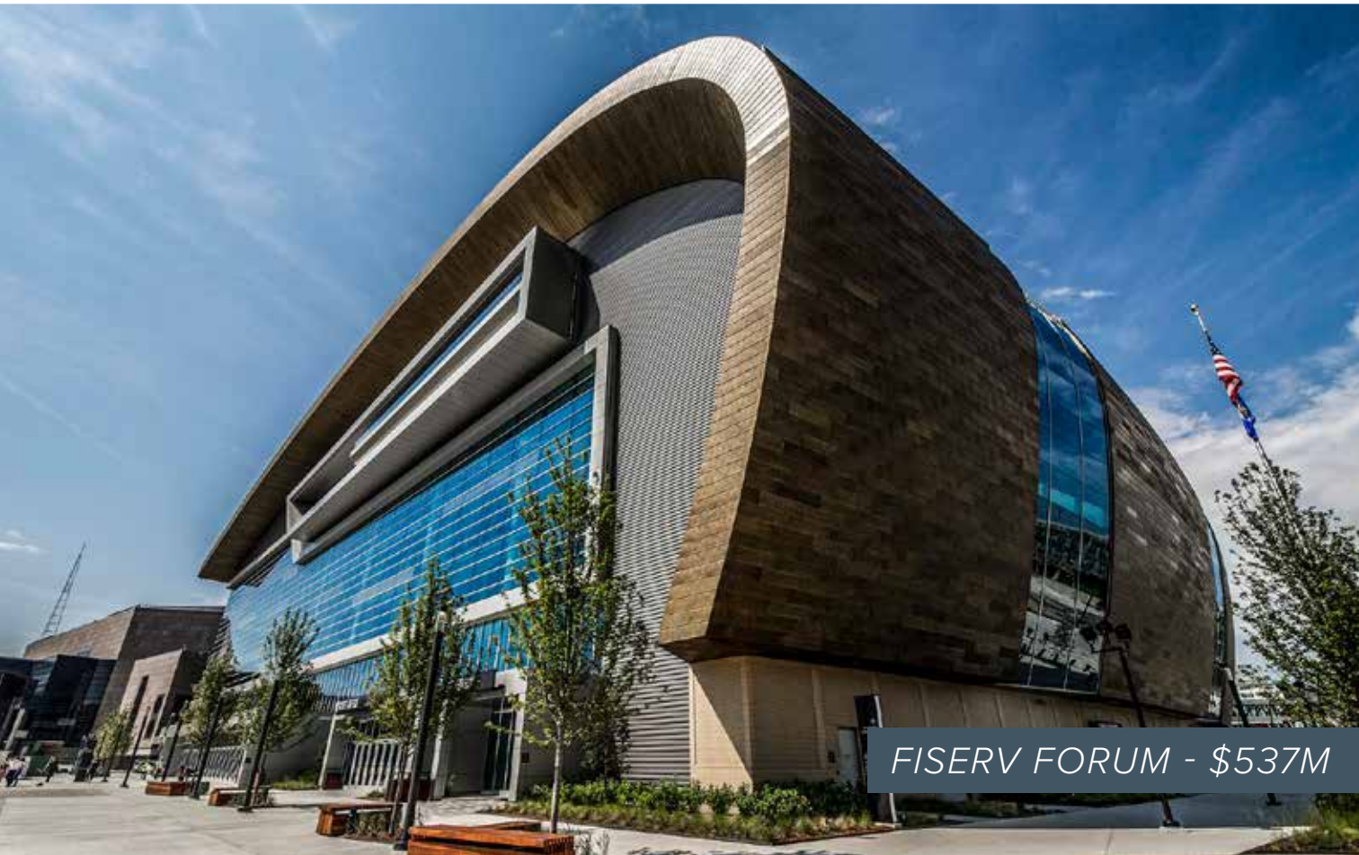
FISERV FORUM - $537M

The Wall Street Journal's Market Watch ranks Milwaukee 20th out of 101 U.S. metro areas on its list of "best cities for business," outpacing cities such as Chicago, Atlanta, San Antonio, Los Angeles and Seattle.