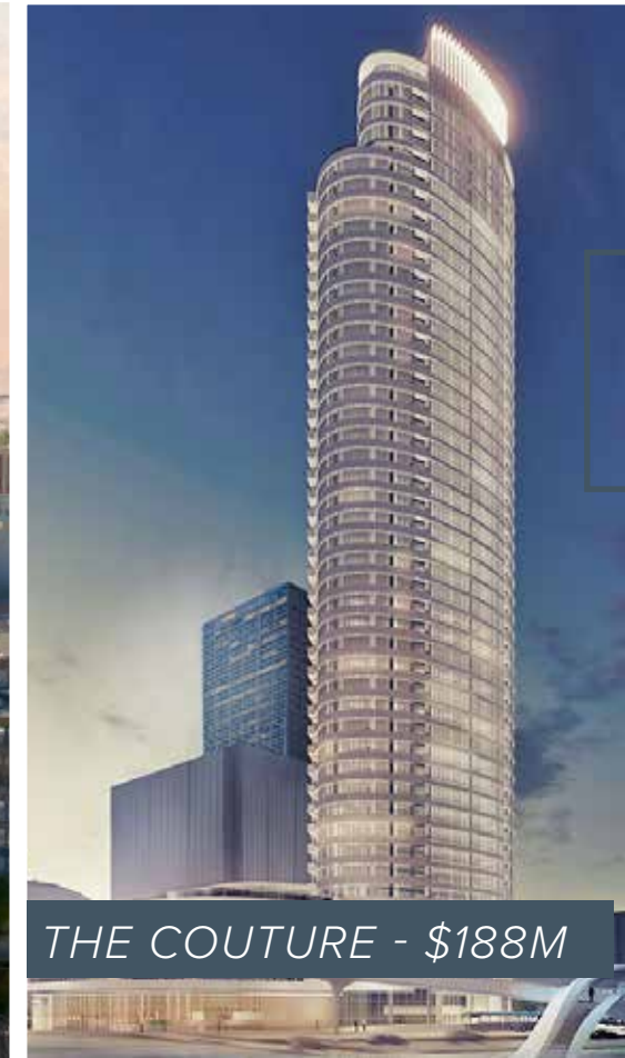
THE COUTURE - $188M