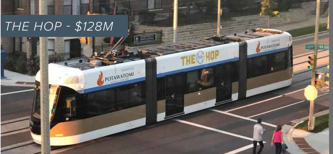
THE HOP - $128M