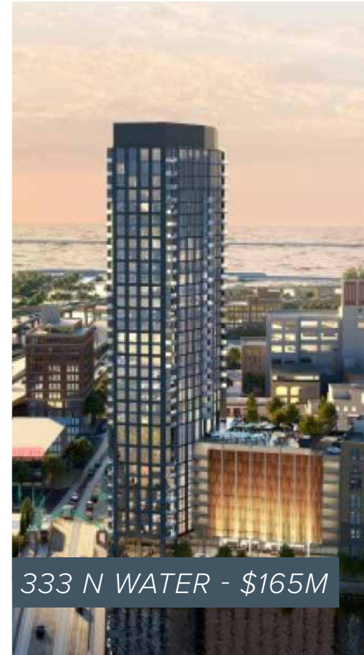
333 N WATER - $165M