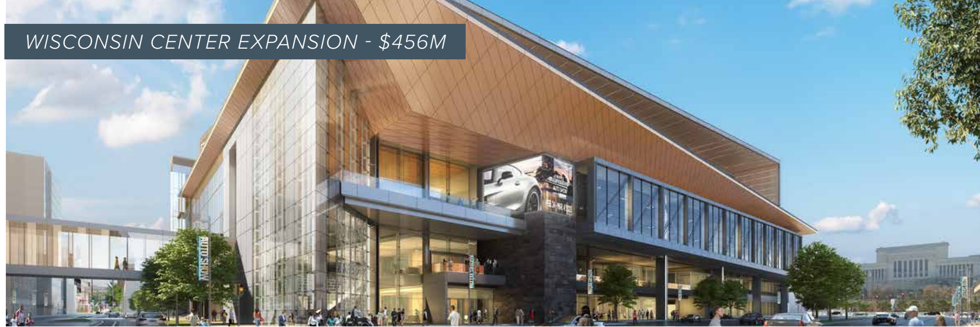
WISCONSIN CENTER EXPANSION - $456M