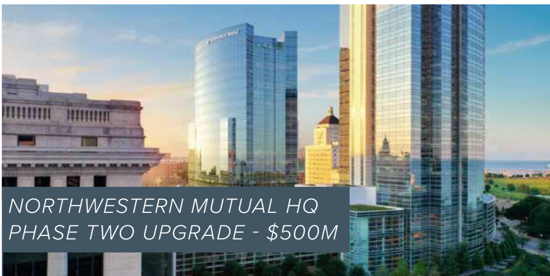
NORTHWESTERN MUTUAL HQ PHASE TWO UPGRADE - $500M