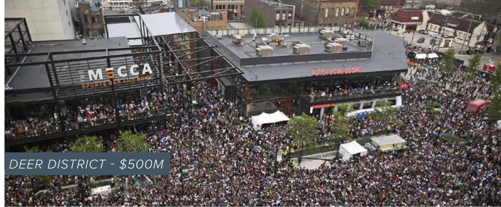
DEER DISTRICT - $500M

Downtown Milwaukee is the economic hub of Southeastern Wisconsin and there has never been a better time to invest. Since 2010, over $4.6 billion has been invested in completed private and public projects and more than $3.1 billion is currently under construction or proposed to start soon, spurring significant momentum that has re-established downtown as the vibrant economic center of Wisconsin.