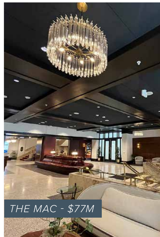
THE MAC - $77M