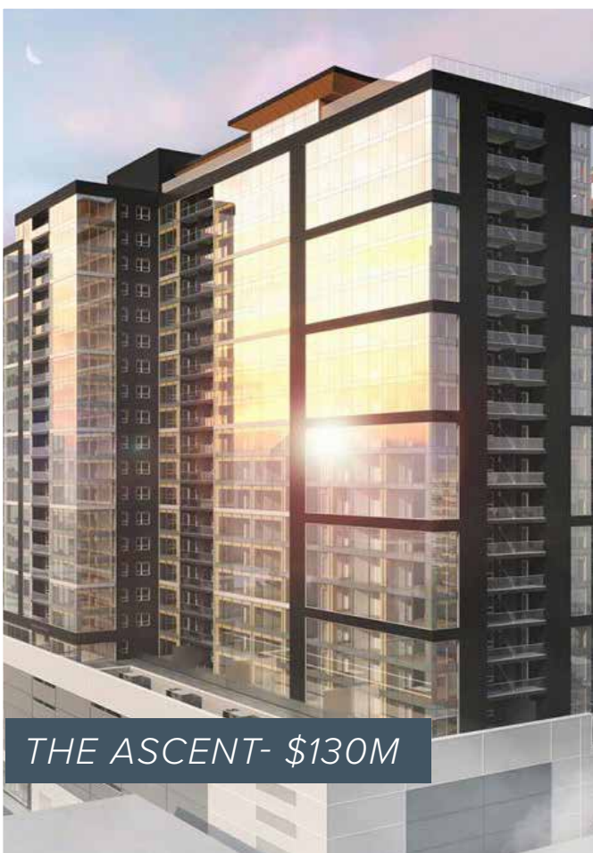
THE ASCENT - $130M