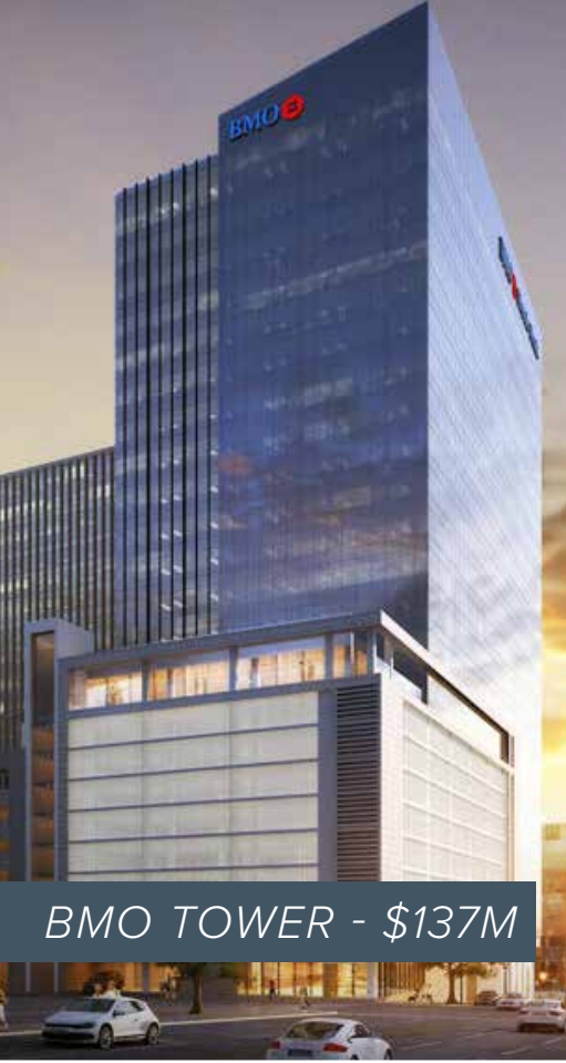
BMO TOWER - $137M