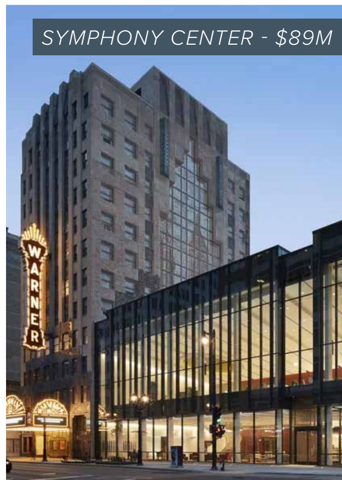
SYMPHONY CENTER - $89M