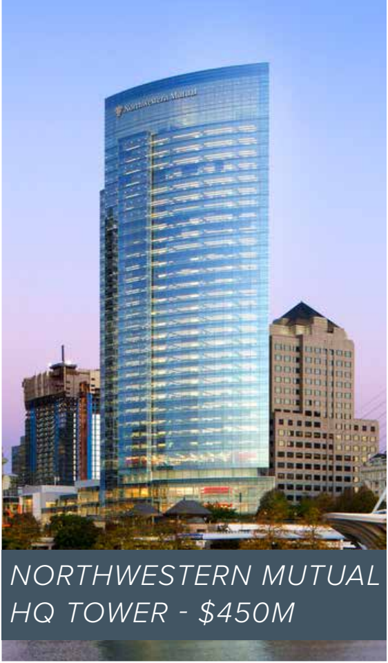
NORTHWESTERN MUTUAL HQ TOWER - $450M