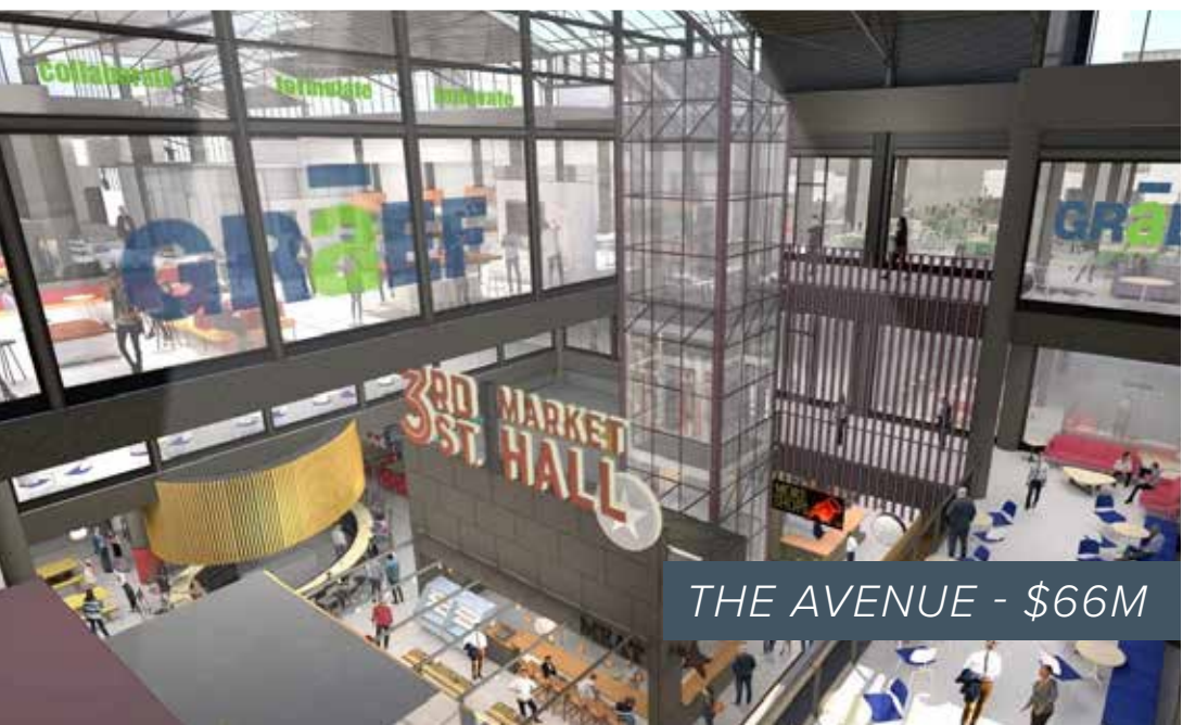
THE AVENUE - $66M