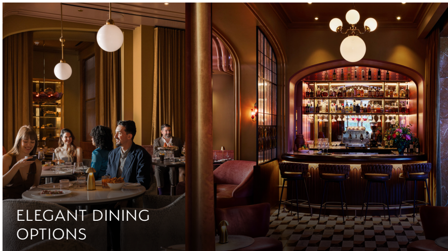
ELEGANT DINING OPTIONS