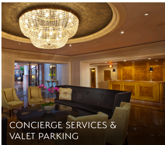
CONCIERGE SERVICES & VALET PARKING