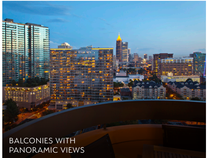
BALCONIES WITH PANORAMIC VIEWS