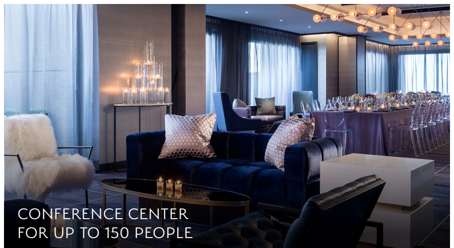
CONFERENCE CENTER FOR UP TO 150 PEOPLE