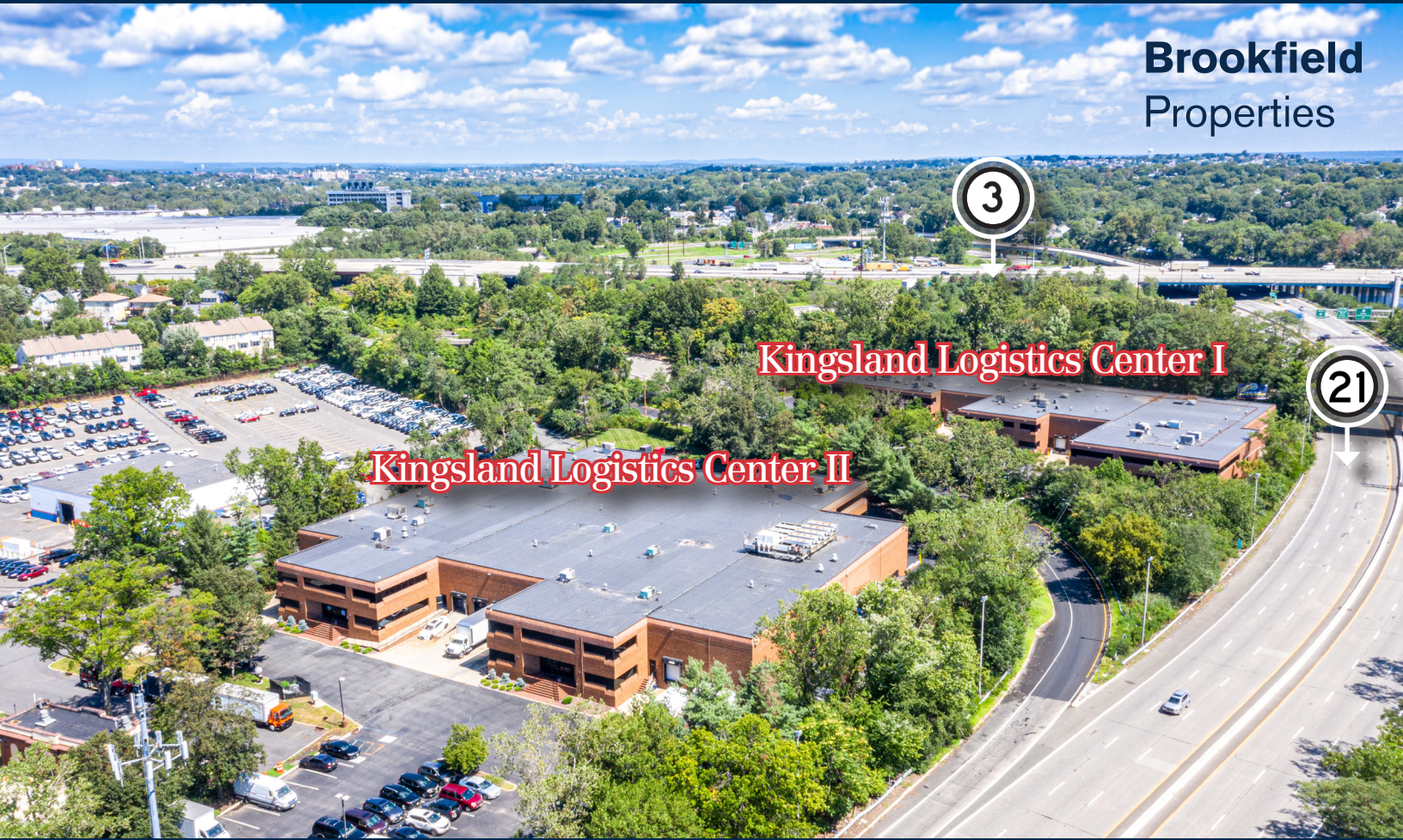
Kingsland Logistics Center I