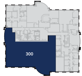
THIRD FLOOR AVAILABILITY