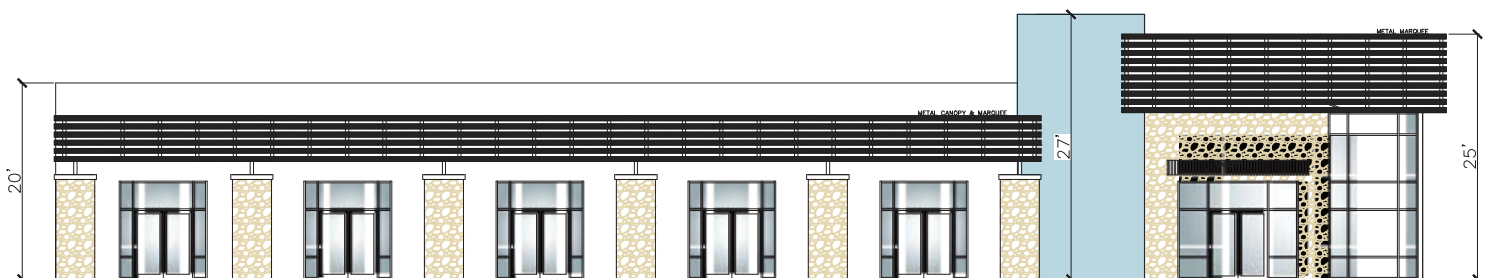
FRONT ELEVATION PLAN