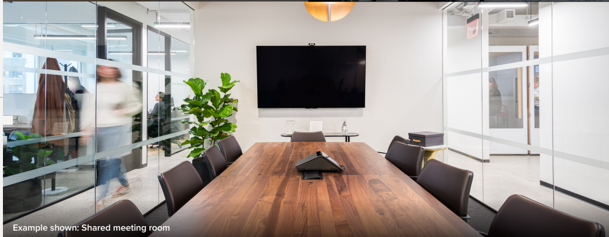
Example shown: Shared meeting room