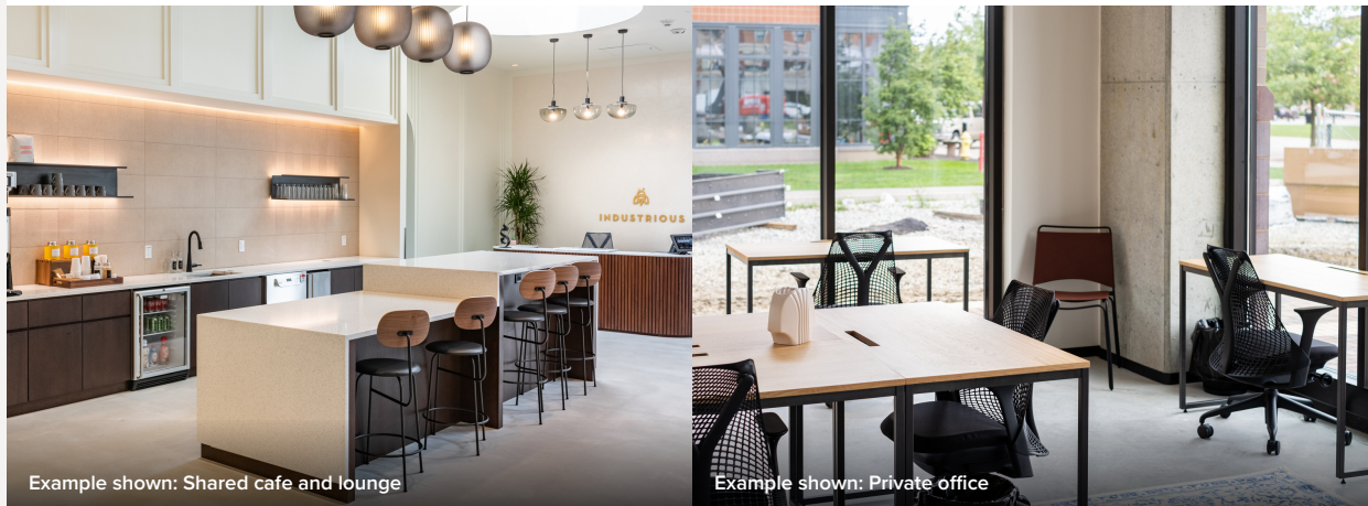
Example shown: Shared cafe and lounge