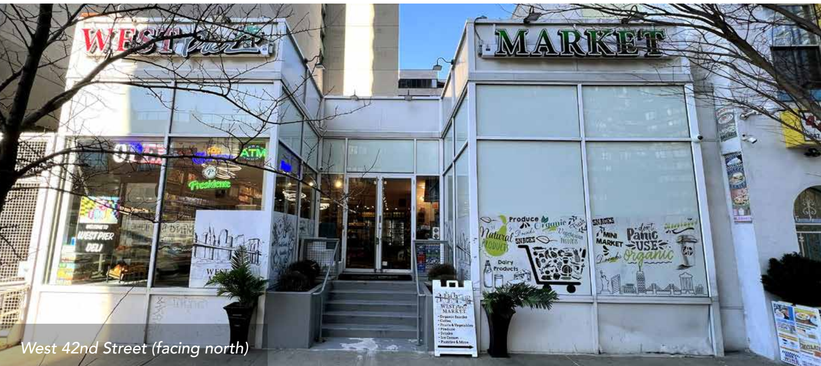
West 42nd Street (facing north)

Currently leased to West Pier Market, this is a rare opportunity to acquire a prime commercial property in the heart of Manhattan with a secure tenant in place.