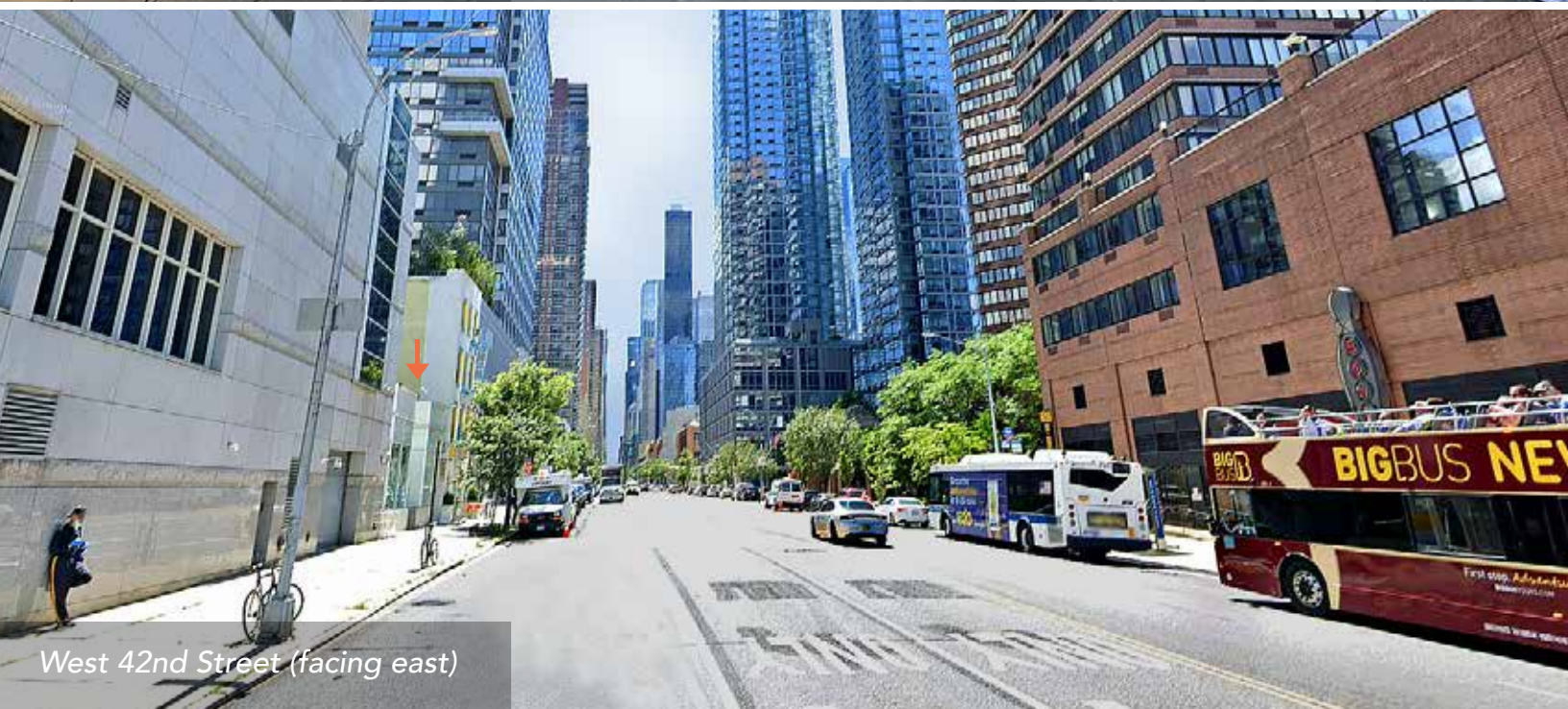
West 42nd Street (facing east)