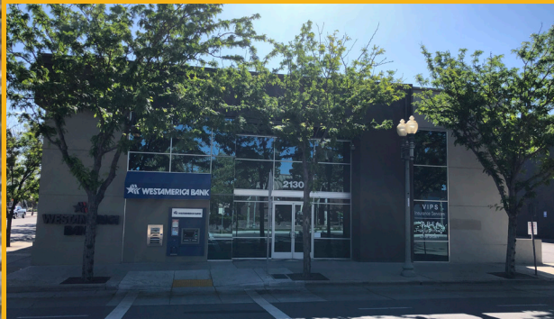
2130 CHESTER AVENUE