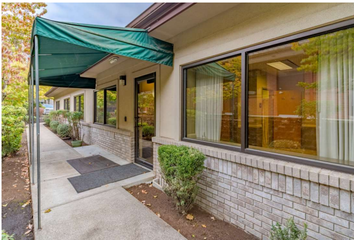
WEST SIDE BUILDING ENTRANCE FOR EMPLOYEES