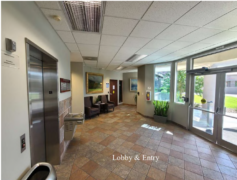
Lobby & Entry

The Foothills Plaza Professional Building is a two (2) story, office building consisting of approximately 21,197 square feet of rentable space. It currently has one 2,606 sqft prime office space for lease on the 2nd floor. The Project is located at 923 South River Road. River Road is a major north/south transportation corridor in St. George. The property is located approximately two blocks from the new IHC 1 million sqft Regional Medical Center.