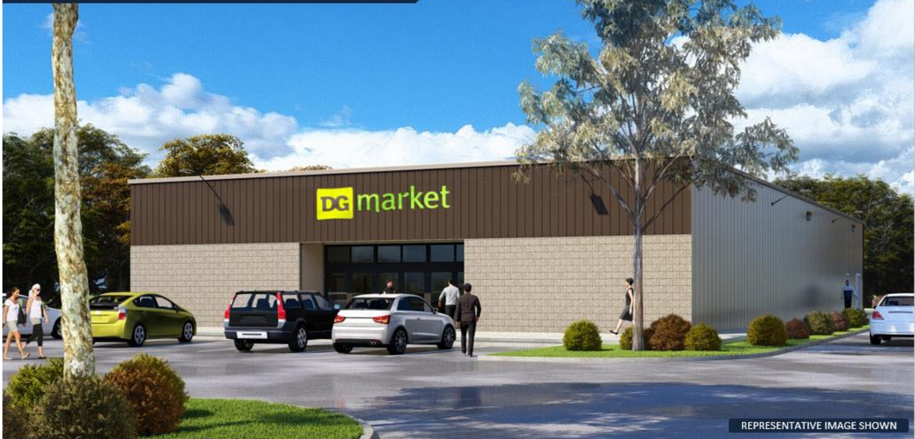
REPRESENTATIVE IMAGE SHOWN