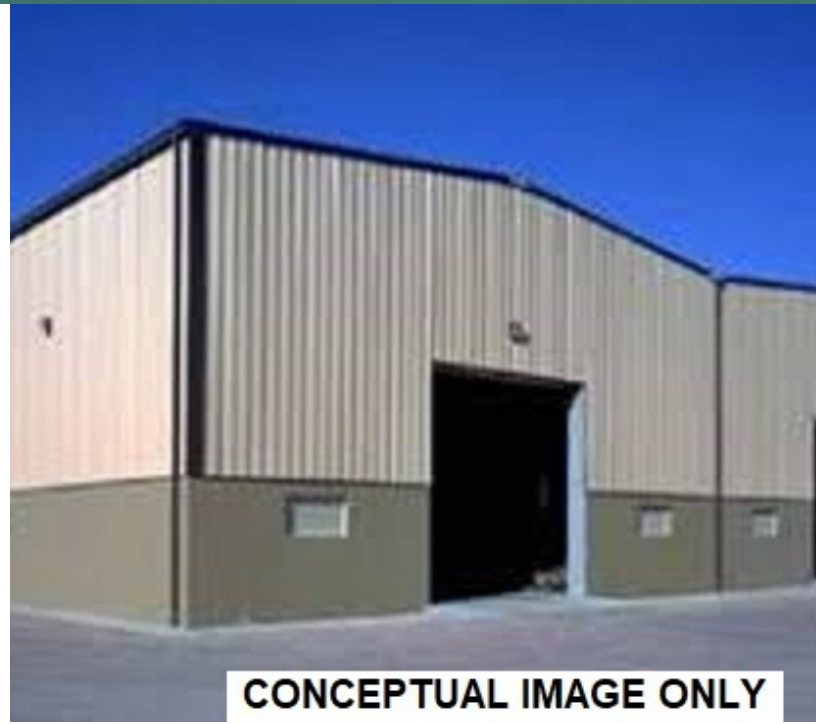
CONCEPTUAL IMAGE ONLY