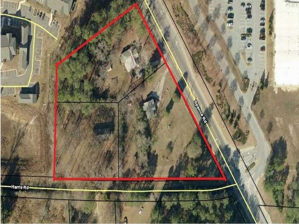
Corner satelittle closeup