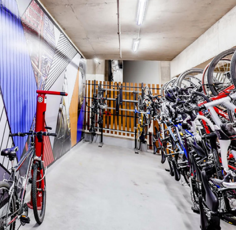
Secure Bike Facility