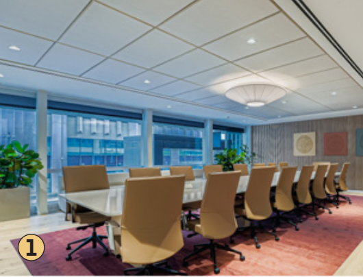
18 Seat Boardroom