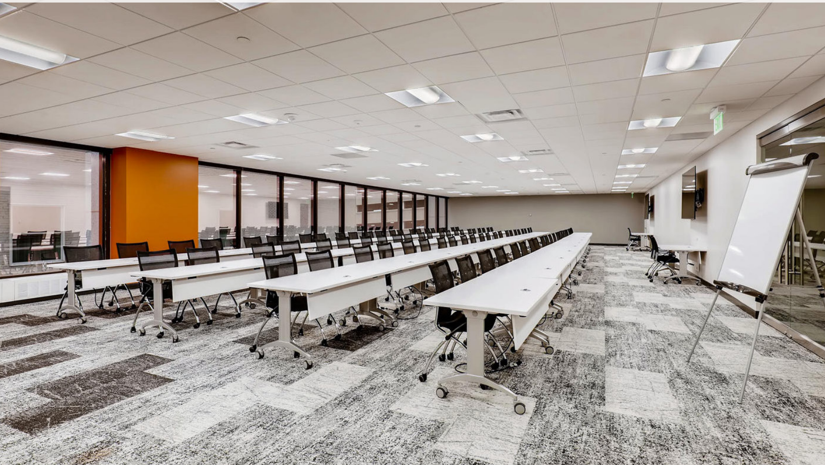
3rd Floor 100-Person Conferencing