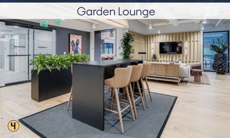
64 Seat Training Room