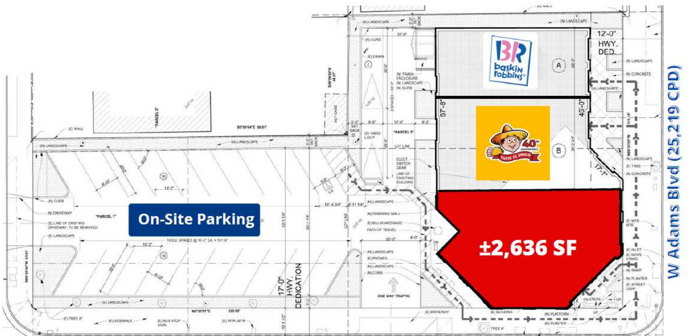
S Vermont Ave (41,612 CPD)