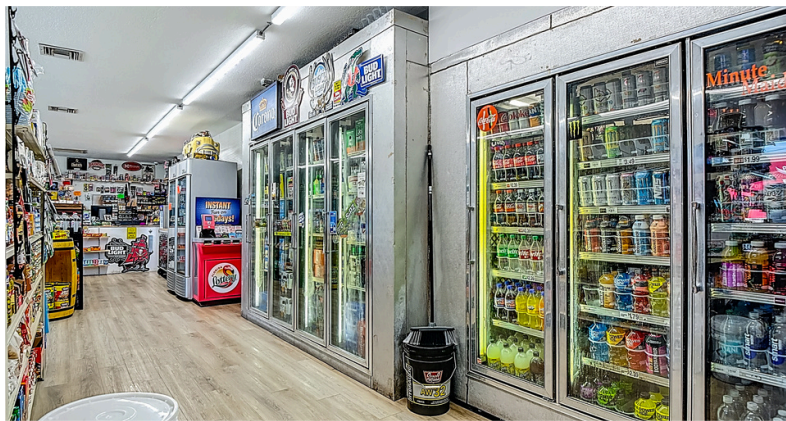
WALK-IN RETAIL BEVERAGE COOLER