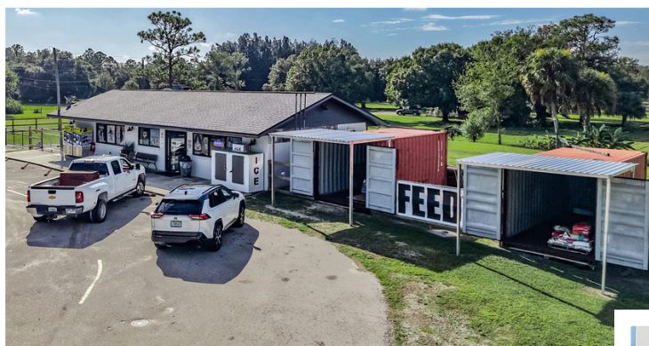
TWO NEW OUTDOOR STORAGE CONTAINERS AND RV HOOK-UP