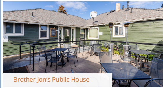
Brother Jon's Public House