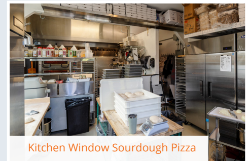
Kitchen Window Sourdough Pizza