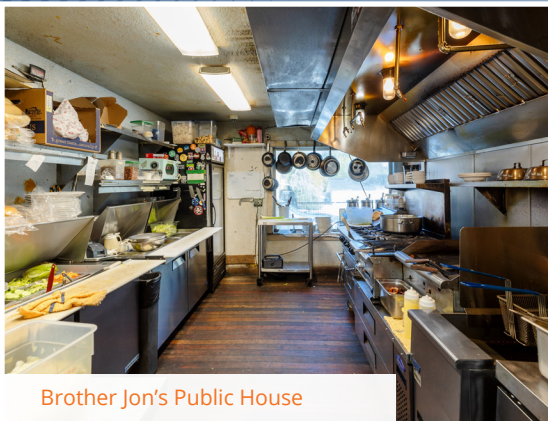
Brother Jon's Public House