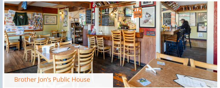
Brother Jon's Public House