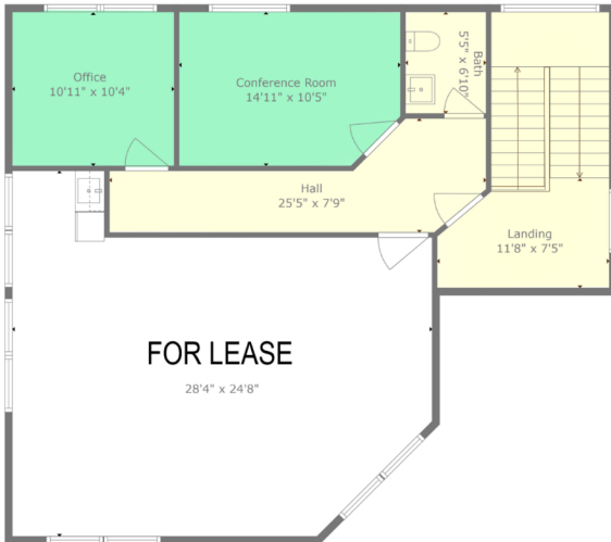
83-B Continental Dr. Total Sq. Footage:1192