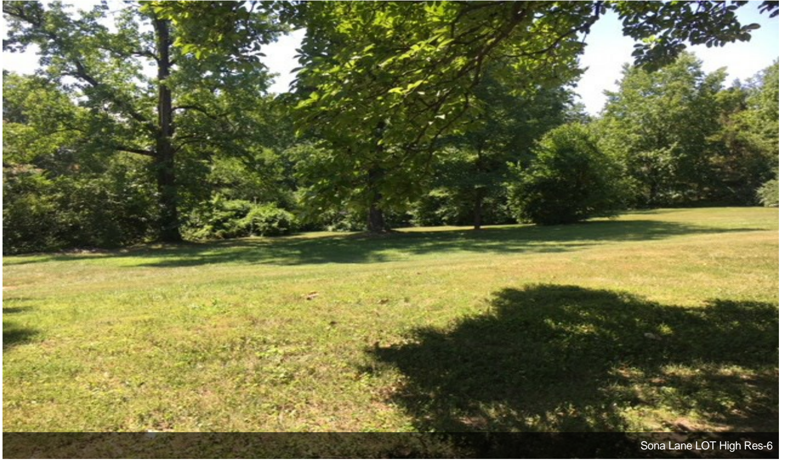
Sona Lane LOT High Res-6